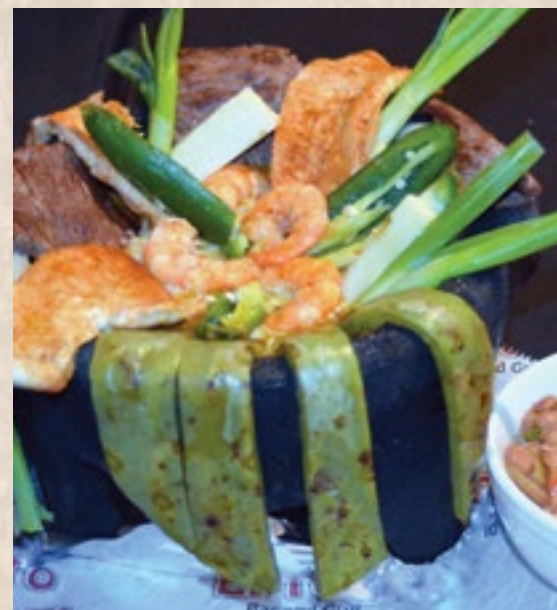
El Toro Molcajete

Marinated, slow-cooked pork served with rice, beans, tortillas and tomatillo sauce • 13.95