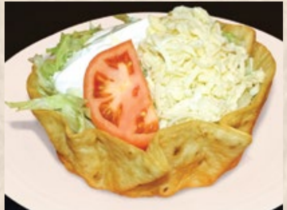
Classic Taco Salad