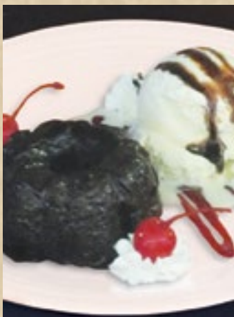
El Toro Lava Cake