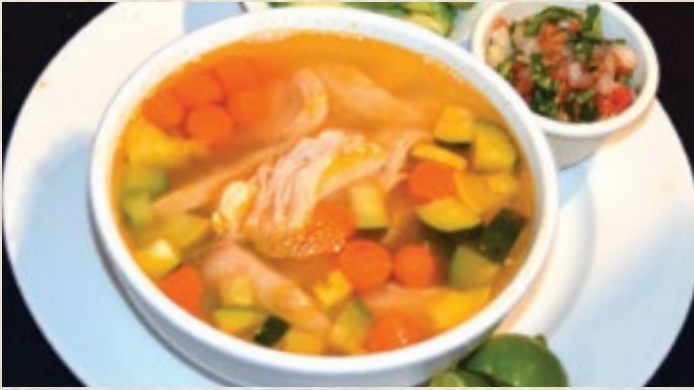
Caldo de Pollo