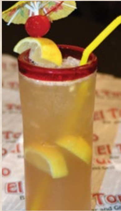
Long Island Ice Tea