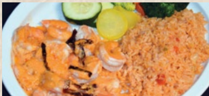
Camarones Chipotle Cream Sauce