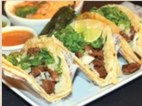
Grilled Steak Tacos